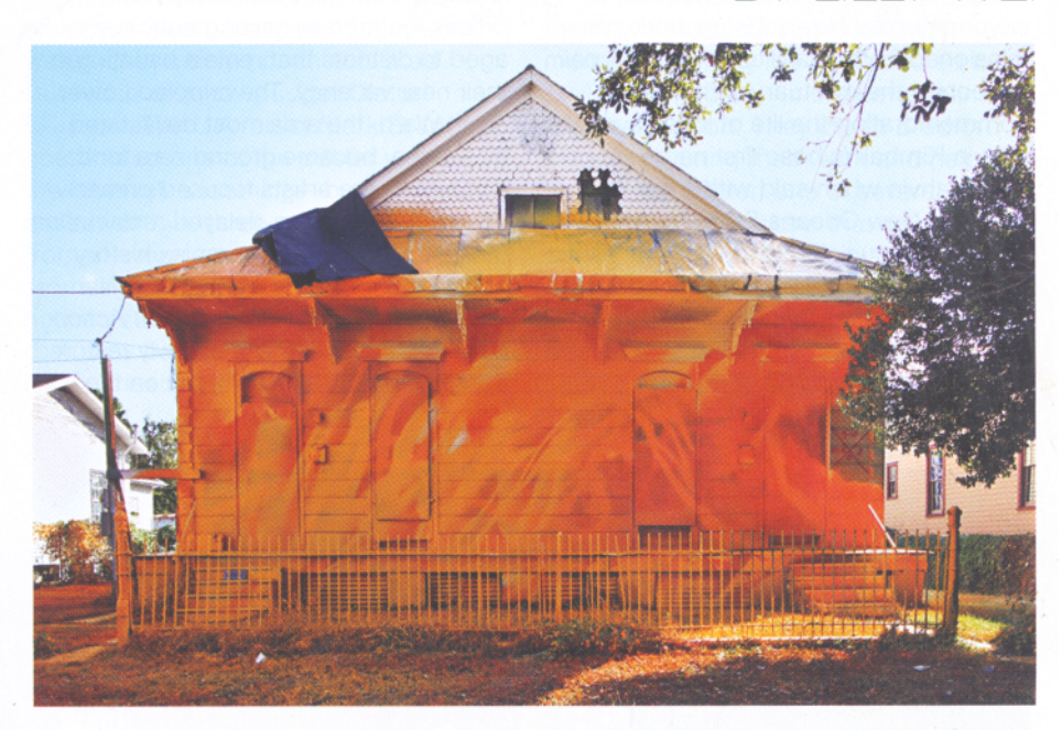
House on Dauphine Street spray painted by Katharina Grosse.