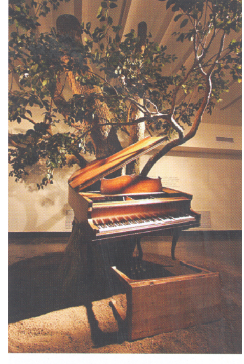
Sanford Biggers: Blossom , 2007, player piano, steel, resin, paint, silk leaves, earth.

landing craft filled the cavernous main room, where a hydraulically created wave regularly washed over the boat in a simulated sea surge. The Higgins boat, conceived and built in great numbers in New Orleans, was used extensively in World War II. Because it was designed to transfer soldiers and