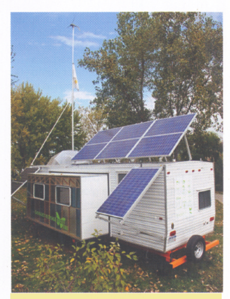
Above, Paul Villinski: Emergency Response Studio, 2008, trailer, solar- and wind-power systems, mixed mediums, approx. 37 by 25 by 19 feet.

Left, Wangechl Mutu: Mrs. Sarah's House, 2008, wooden beams, lights and mixed mediums.