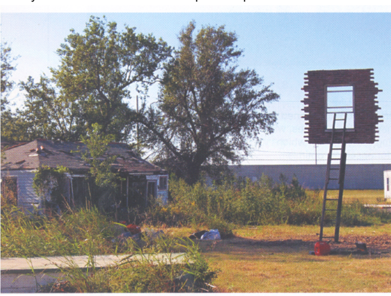
View of Leandro Erlich's Window and Ladder—Too Late for Help, 2008, metal ladder, fiberglass brick wall and mixed mediums.

In the vicinity was New York artist Paul Villinski's FEMA-style trailer-more handsome, spacious and lightfilled than the government models, minus the formaldehyde fumes that made them toxic. The dwelling has a geodesic skylight, a large window, an exterior wall that drops down as a platform, and a neatly compact bedroom and bathroom. Powered by solar panels, it generated enough energy to also light the house next to it. Villinski, who has spent much time in New Orleans throughout his life, conceived the mobile live/work studio in response to the displacement of New Orleans artists after Katrina. A sort of downsized, transportable Usonian house for the 21st century, it recalls other inventive shelter projects